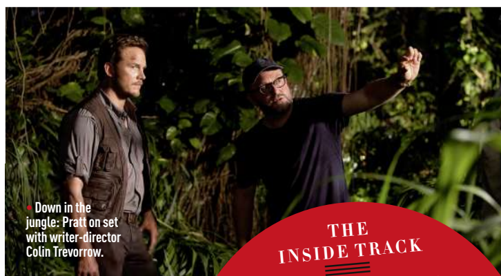
• Down in the jungle: Pratt on set with writer-director Colin Trevorrow.