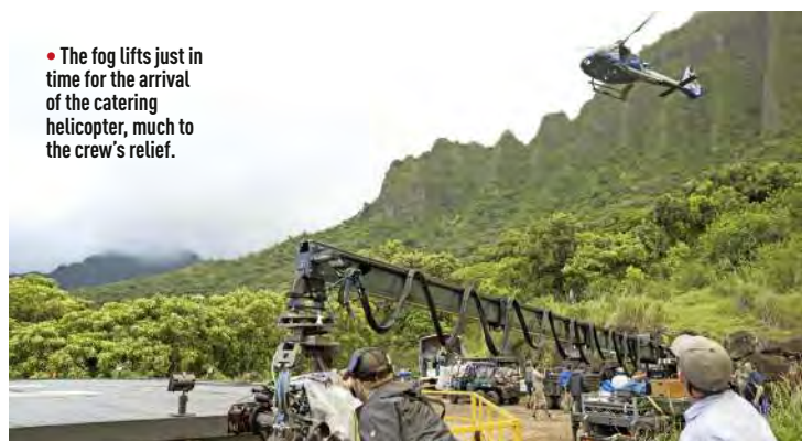
• The fog lifts just in time for the arrival of the catering helicopter, much to the crew's relief.

hundreds of panicked people fleeing paddocks or running down Main Street, Jurassic World's central thoroughfare, presumably being chased by all manner of beasts.